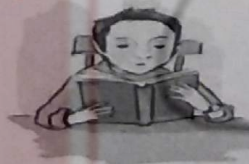
(read the book)

54. The boy is really tired, but he has to read the book.