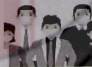
(wear the mask)

55. Many people are still becoming sick because of COVID 19, so we should