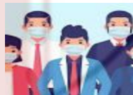
(wear the mask)