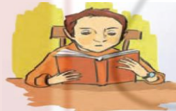
(read the book)